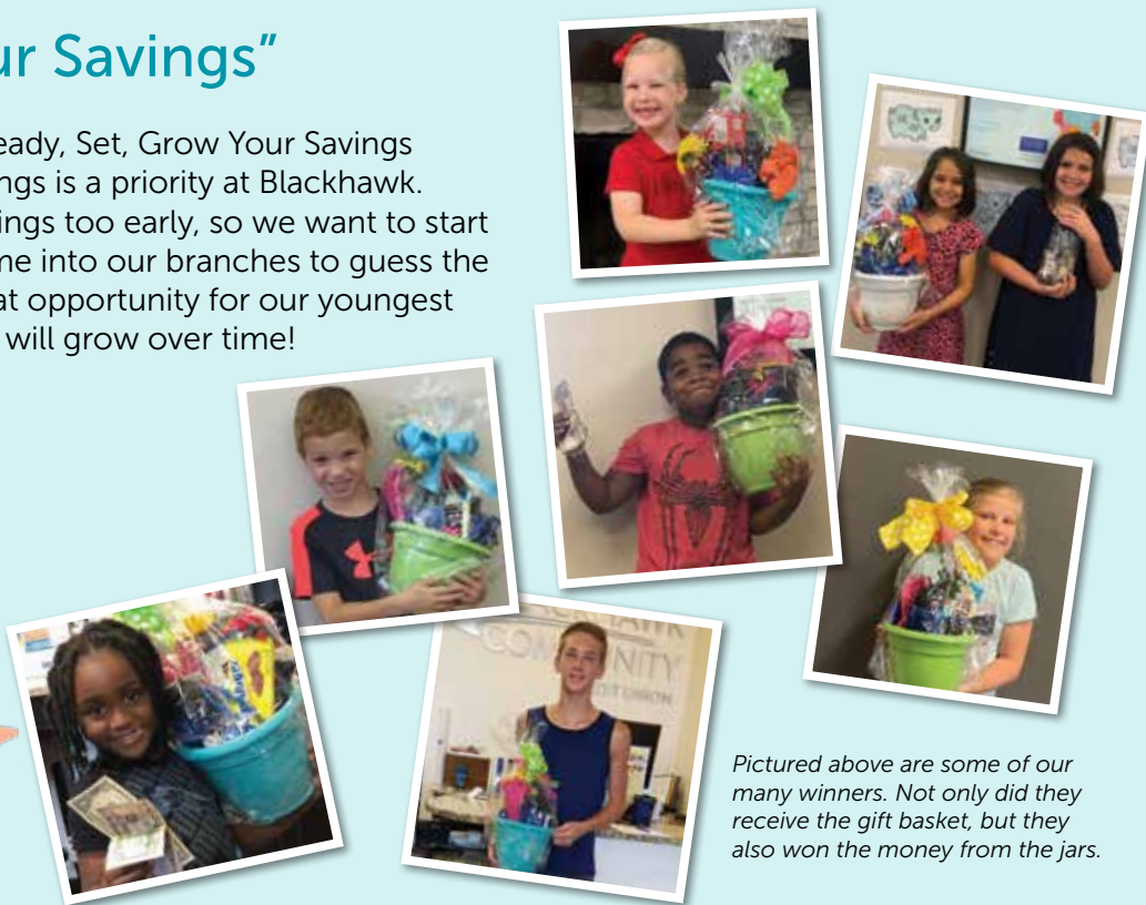
Pictured above are some of our many winners. Not only did they receive the gift basket, but they also won the money from the jars.