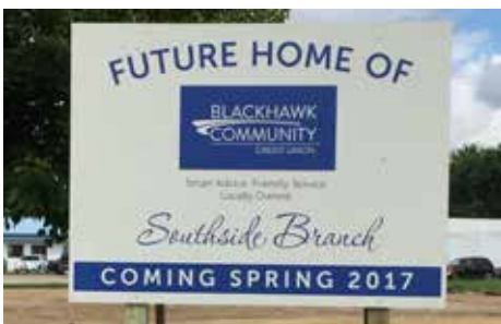
Our new Southside branch will be located at 1545 Center Ave., Janesville.

Blackhawk Community Credit Union is expanding. We just broke ground on our new branch on the Southside of Janesville which should be opening later this summer.