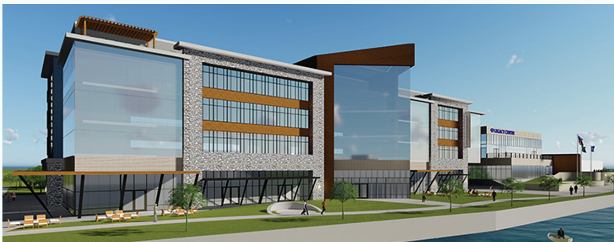
A river view rendering of the Legacy Center and Reflections Plaza from Angus-Young Associates.