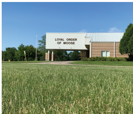
Future site of our headquarters, 2701 Rockport Road.

Moving locations means that we can begin construction immediately and ensures that we can meet the timeline to donate our Kennedy Road Administrative Building to HealthNet in 2021. We will now have four branches, administrative offices, a conference center, and the Legacy Center that span the entire city of Janesville.