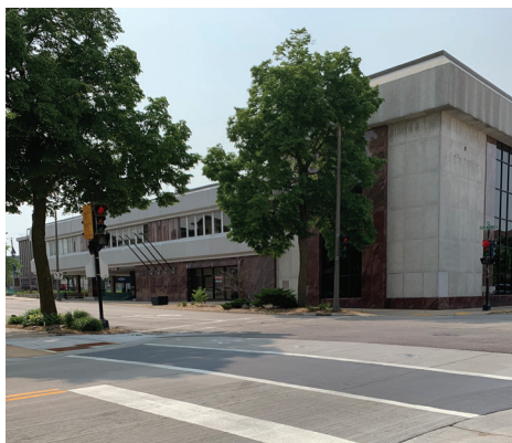
Future site of the Legacy Center, 100 West Milwaukee Street.