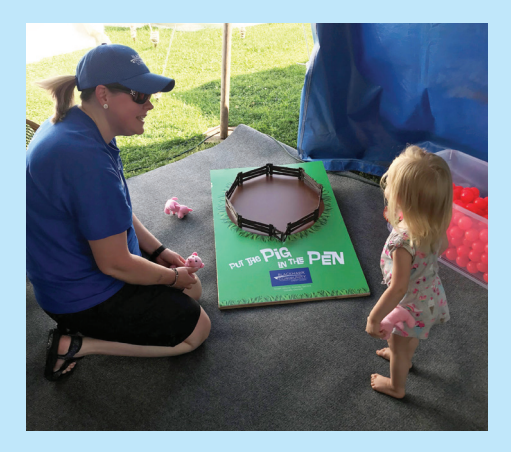
One of our smallest members playing a game at the Blackhawk tent.